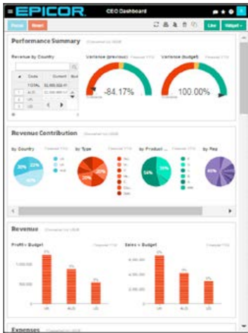
Dashboard on a smartphone

Epicor Data Analytics is a cloud-based service that also minimizes cost impacts on your current system hardware, software, and maintenance budgets.